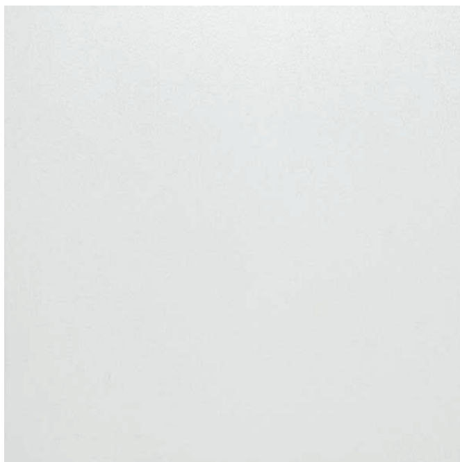
60 x 60 cm (24 x 24) Structured Finish WI.MG.IRD.2424.ST